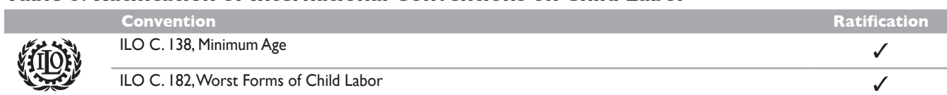
Table 3. Ratification of International Conventions on Child Labor

Nigeria has ratified all key international conventions concerning child labor (Table 3).