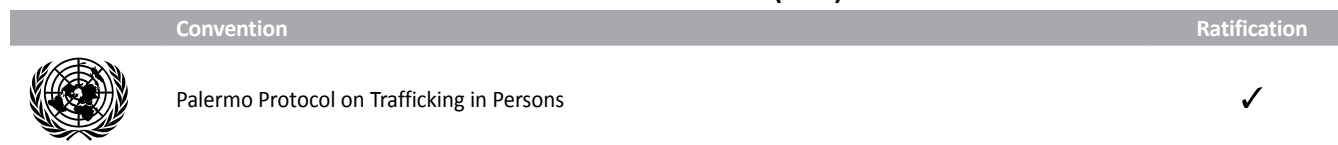
Table 3. Ratification of International Conventions on Child Labor (cont)

The government has established laws and regulations related to child labor (Table 4). However, gaps exist in Bahrain’s legal framework to adequately protect children from the worst forms of child labor, including the prohibition of commercial sexual exploitation of children.