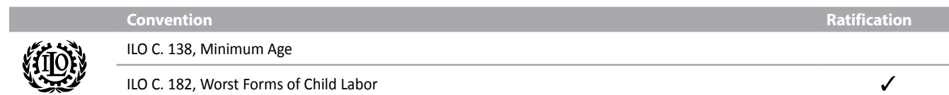
Table 3. Ratification of International Conventions on Child Labor

Vanuatu has ratified most key international conventions concerning child labor (Table 3).