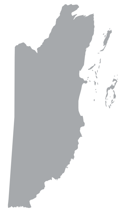
Figure 1. Working Children by Sector, Ages 5-14

Source for all other data: Understanding Children's Work Project's analysis of statistics from National Child Activity Survey (SIMPOC), 2013.(4)