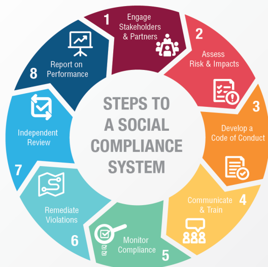
U.S. Department of Labor Comply Chain Model