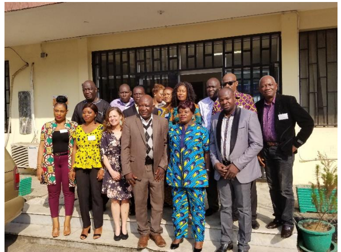
Figure 3: Participants at the CLEAR II training for Chamber of Commerce