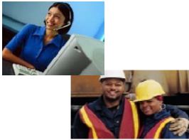
Top 30 U.S. States & Territories, by Total Workers Certified

“INNOVATION DISTINGUISHES BETWEEN A LEADER AND A FOLLOWER” - STEVE JOBS