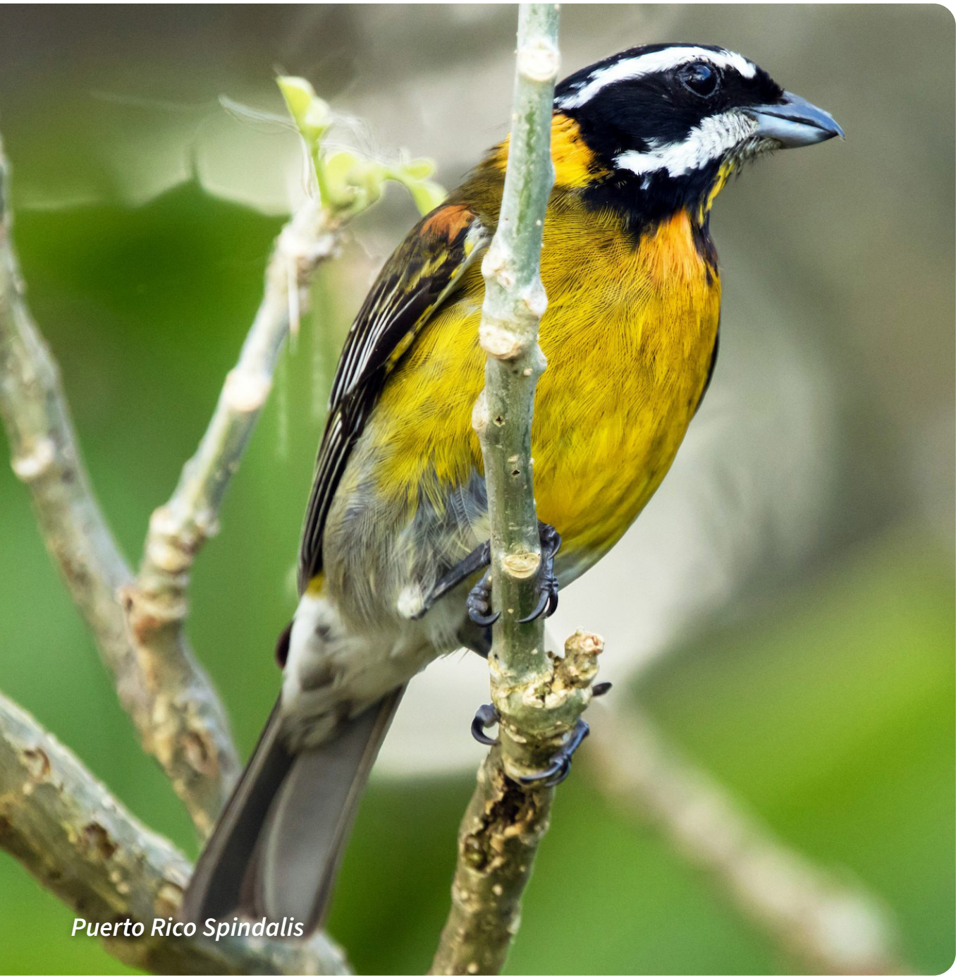
Puerto Rico Spindalis

➡ Hover over each category to learn more.