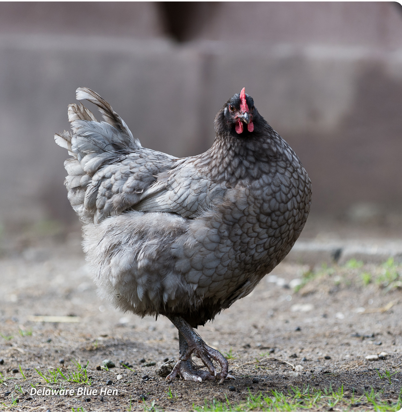
Delaware Blue Hen