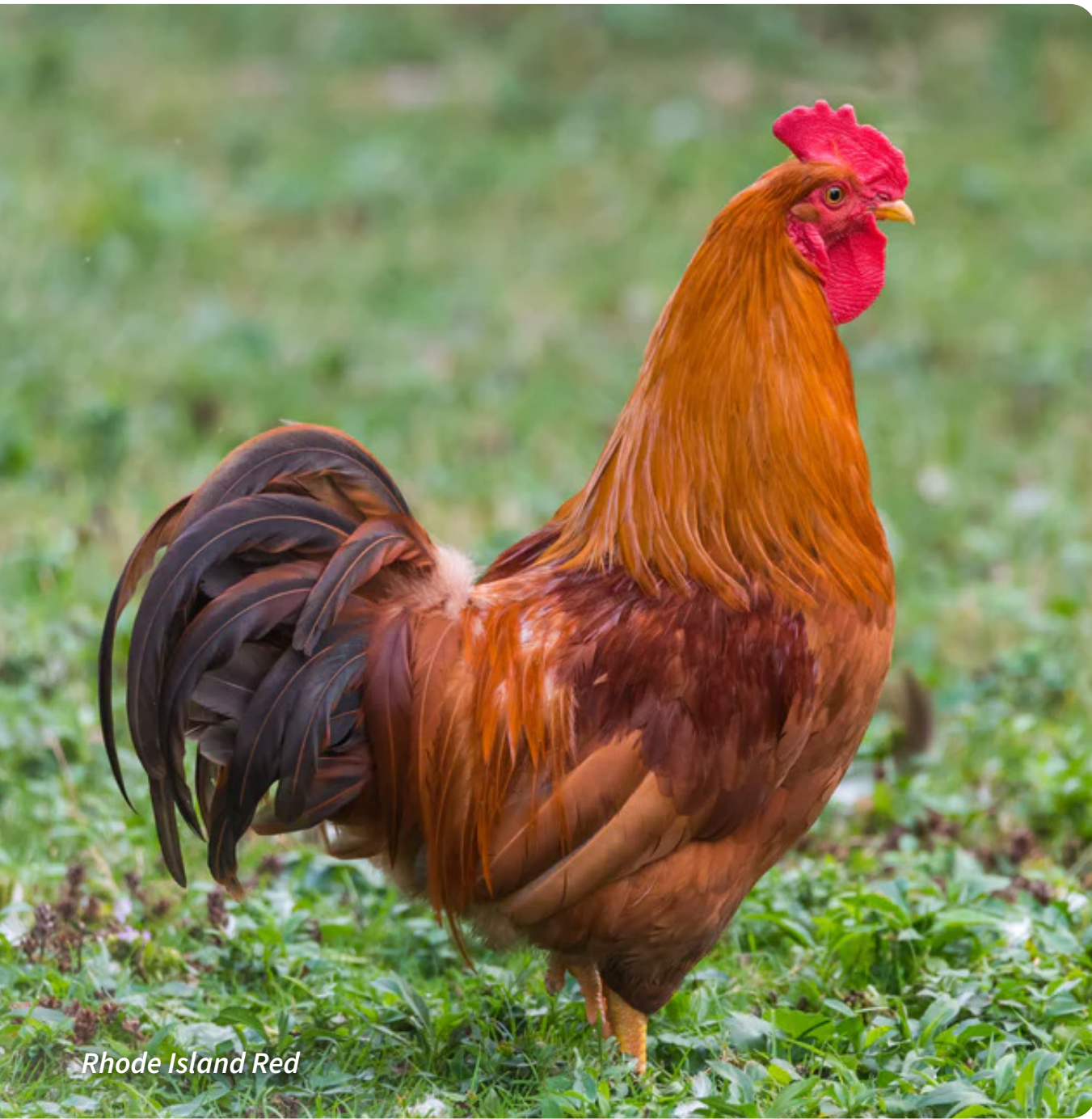
Rhode Island Red

➡ Hover over each category to learn more.