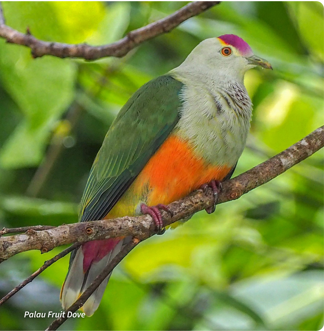
Palau Fruit Dove

➡ Hover over each category to learn more.