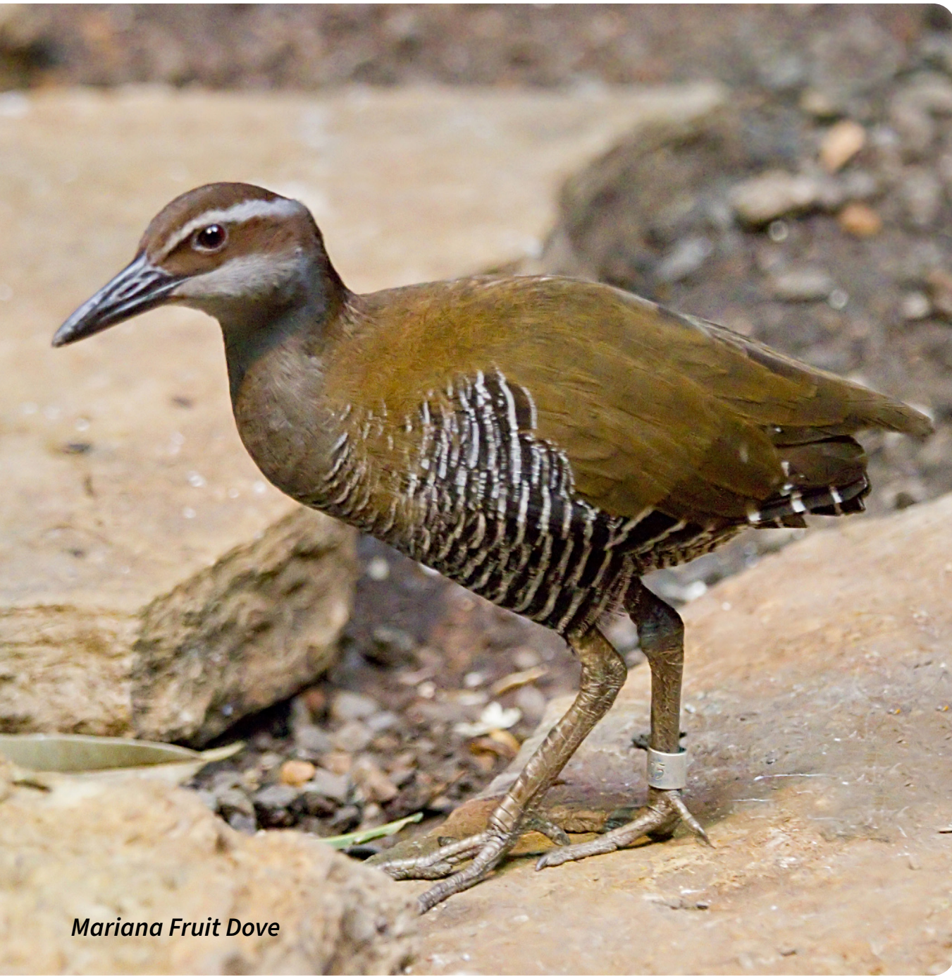
Mariana Fruit Dove

➔ Hover over each category to learn more.