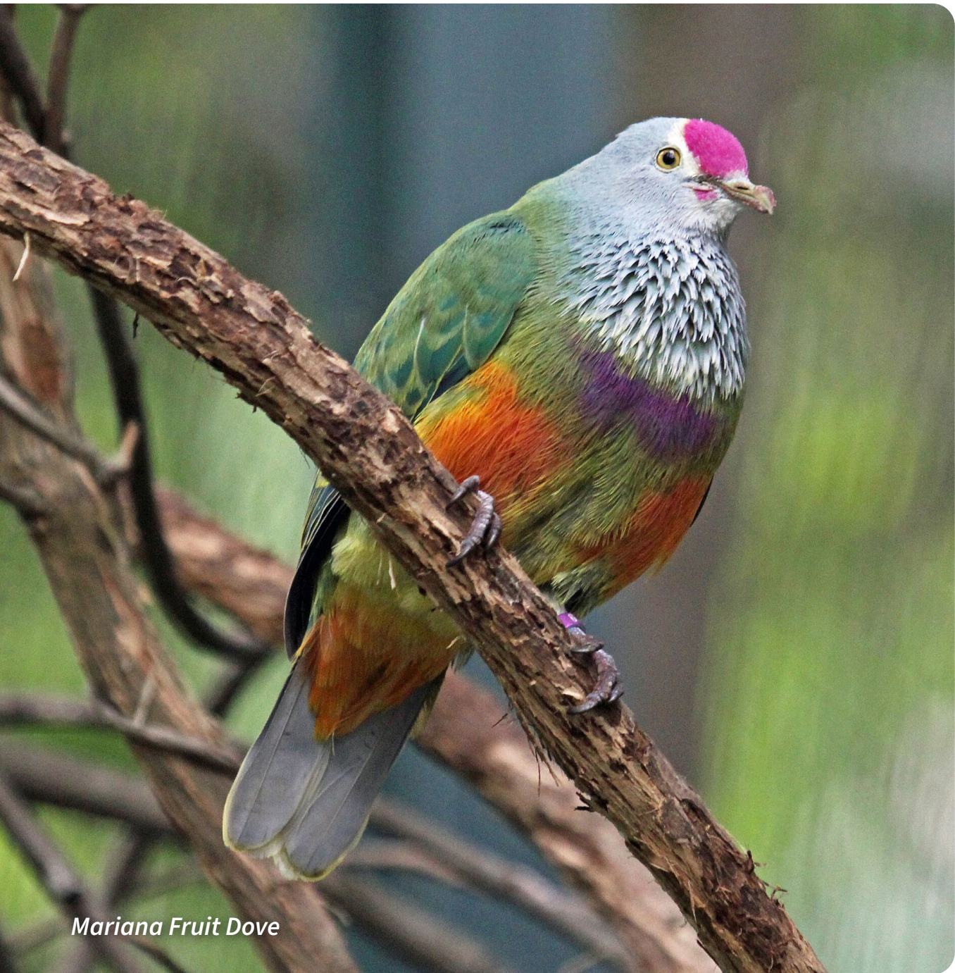
Mariana Fruit Dove

CNMI Department of Labor – Workforce Investment Agency