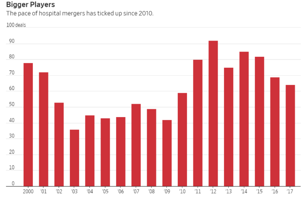
Figure 2: The Pace of Hospital Mergers Has Ticked Up Since 2010<sup>74</sup>