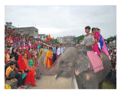
Some female workers is seen to enjoy their ride on elephant

Workers' Festival: In consequences of previous year, BKMEA organized the largest garments workers festival on 18 December 2009 at Osmani Stadium, Narayanganj, Bangladesh. About one hundred thousand garments workers thronged the daylong event to seek relief from the rigid daily routine. Cultural events including dazzling fashion show, dancing program, awareness raising stalls, song, folk fair, puppet show, magic Show, jokes, merry-go-round, monkey dance, horse ride, elephant ride, training session on labor rights and fireworks were the key attractions of the fair. All the cultural events were staged by garments workers which was very amazing. Training sessions on basic rights of workers and using of Personal Protective Equipments were additional attractions of the festival. First ever workers festival was arranged on 24 October 2008 at Narayanganj. It was a show solely dedicated for three million readymade garments workers of Bangladesh. BKMEA, the country's biggest foreign currency-earning industry, organized this event as a part of their regular initiatives for ensuring harmonious relationship between owner and worker.