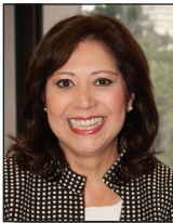
Hilda L. Solis U.S. Secretary of Labor

Please join U.S. Labor Secretary Hilda L. Solis for a panel discussion on people with disabilities in the performing and visual arts.