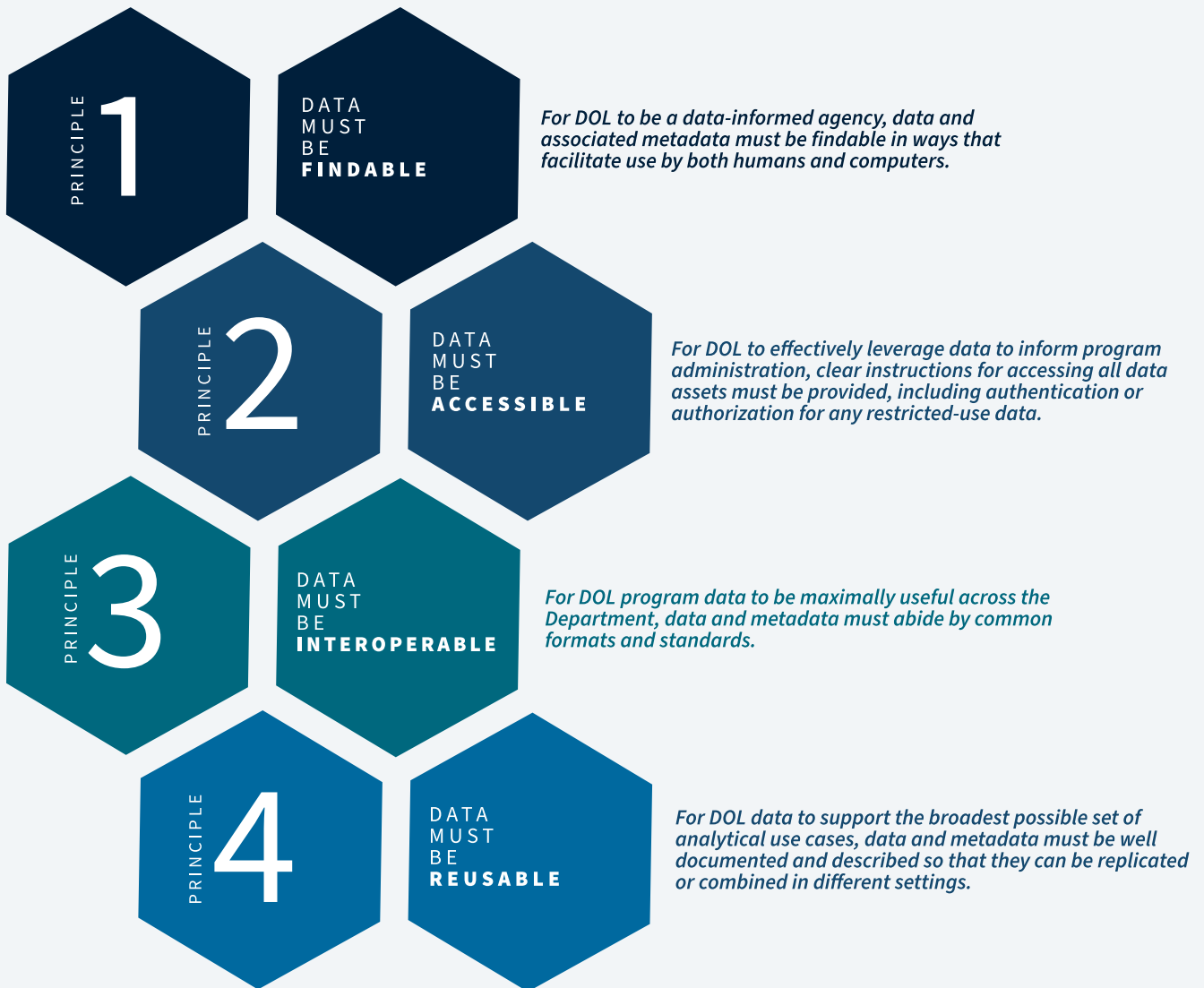
Fig. 2: The FAIR Principles