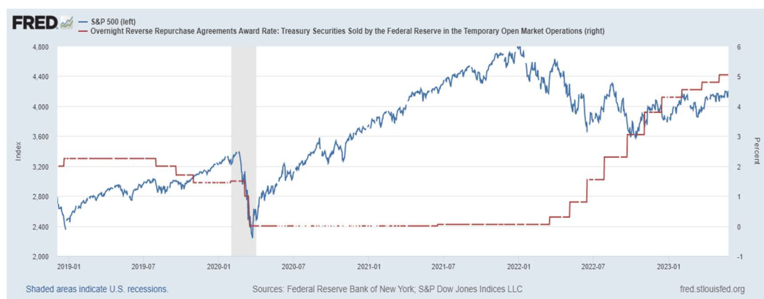
Figure 1, Equity Gains and Interest Rate Increases Combine to Make PRTs More Affordable Than in Recent Years